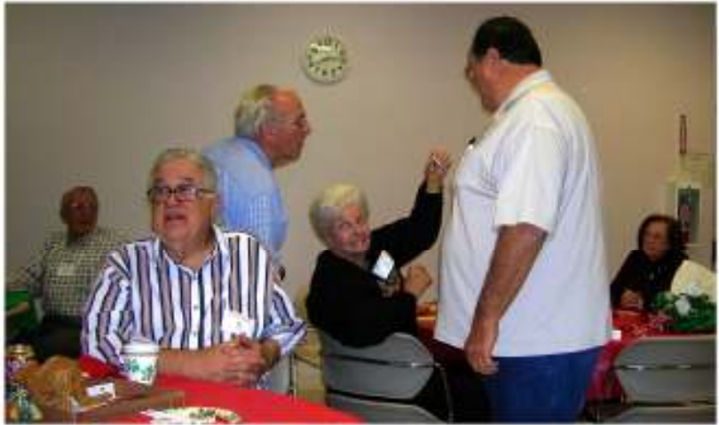
The wrapped handcrafted ornament gift exchange was enjoyed by all!