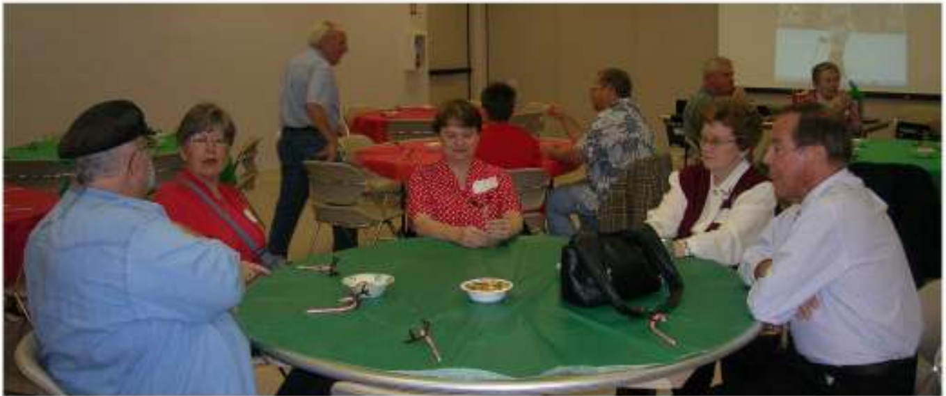
It's munch time!