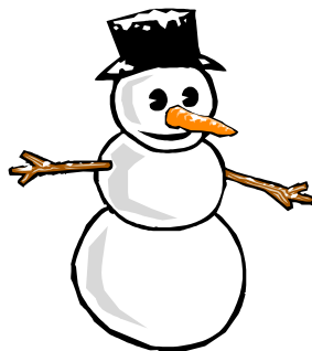
Let it snow, let it snow, let it snow!!!