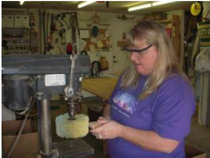
LaVaun Ward Spindle Sander